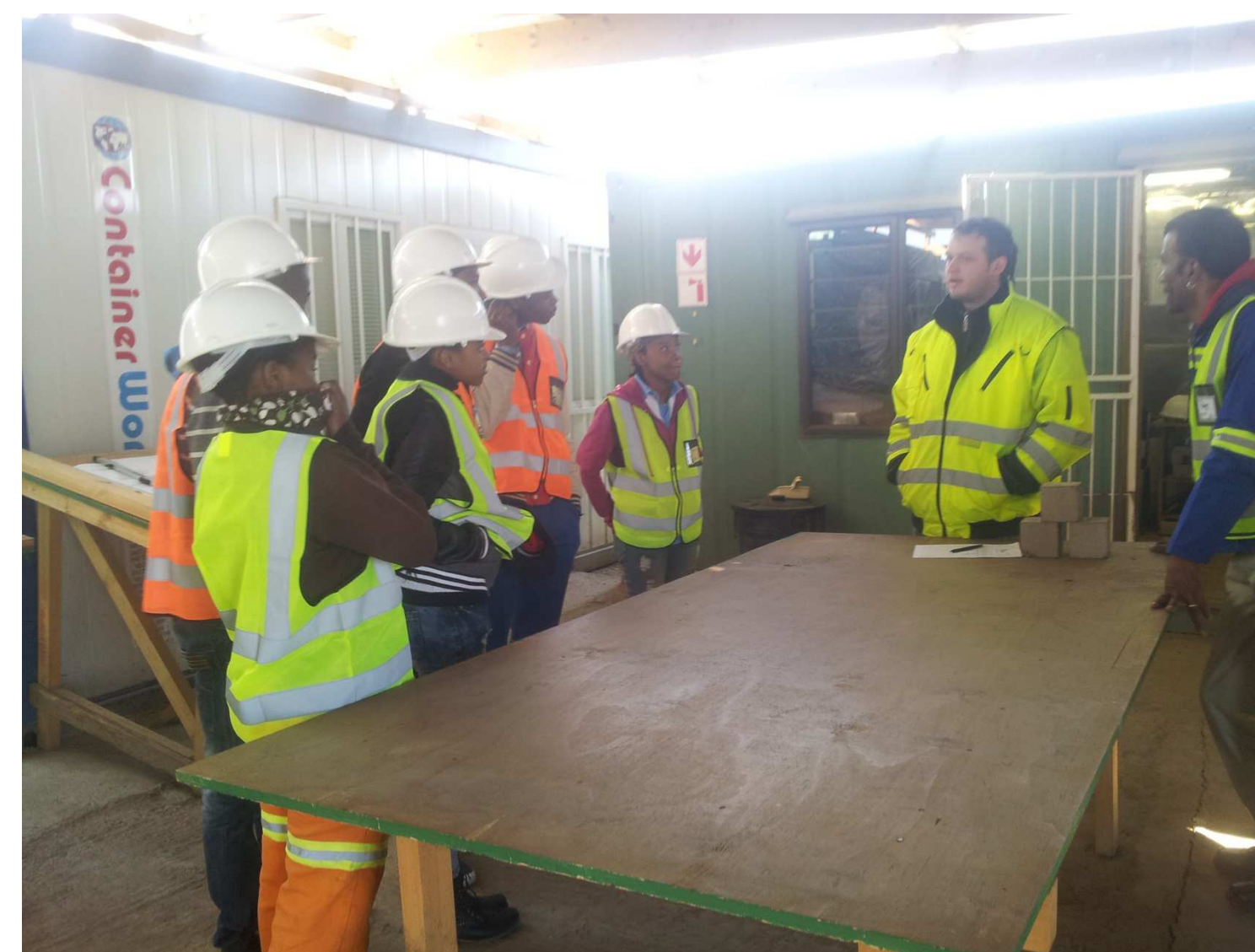
Pupils being inducted on safety by the Safety Officer at Homevale Wastewater Treatment Works before their site tour