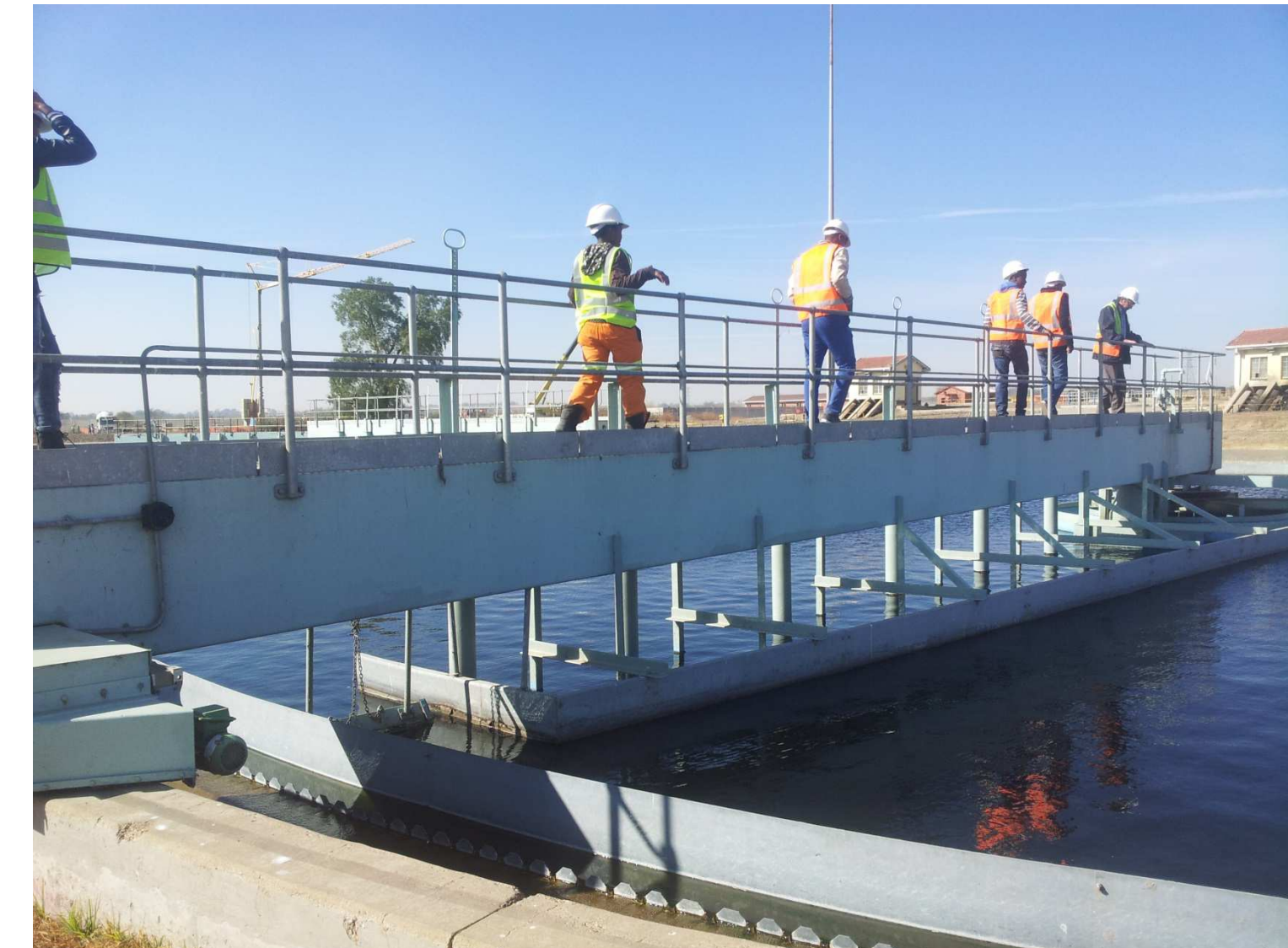
Hannes du Toit showing the pupils the finished secondary settling tank in operation