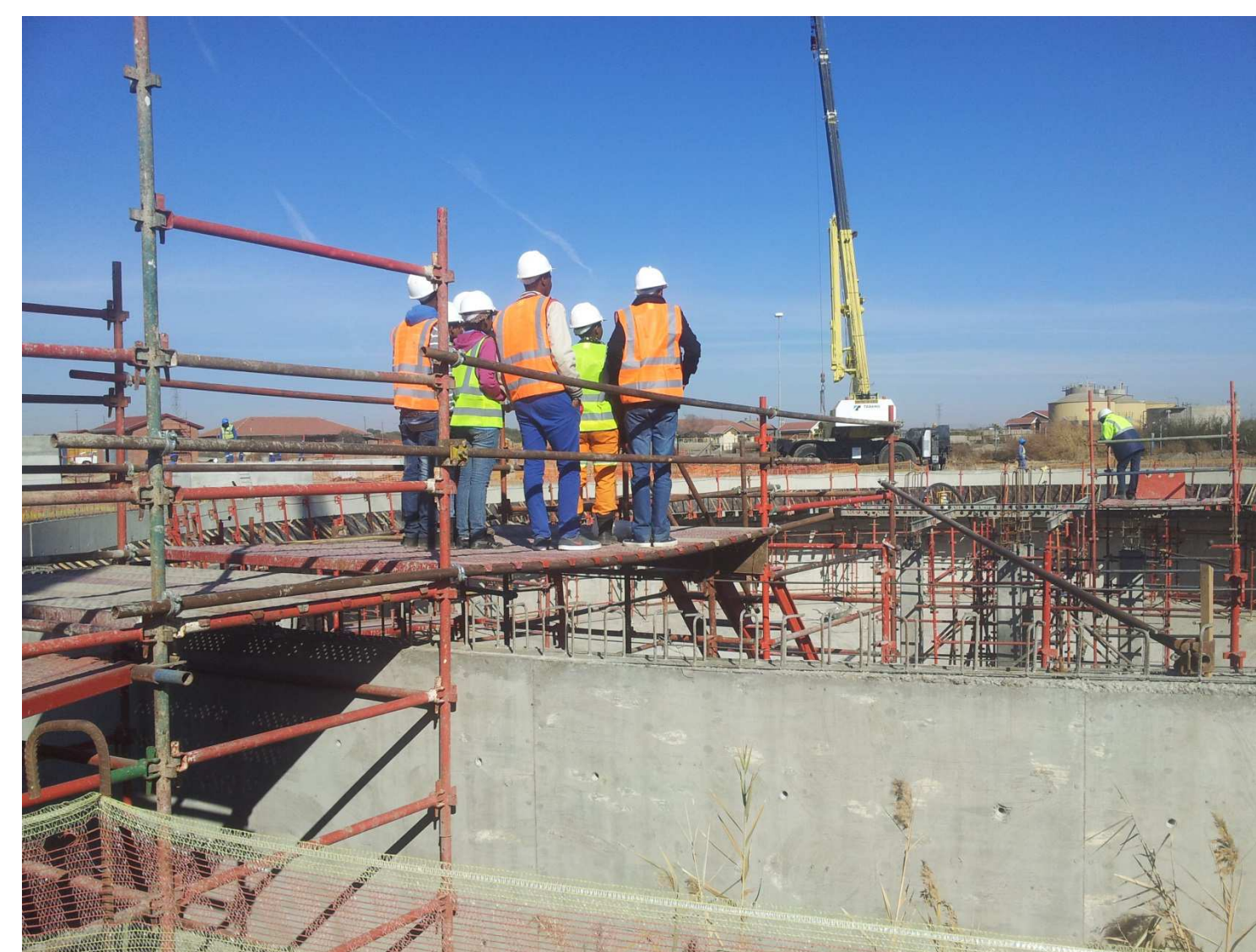
Pupils taking a tour around the construction site. Here they are viewing the construction of a secondary settling tank